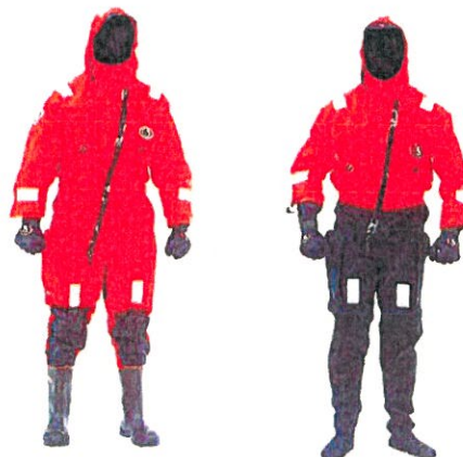
Ursuit RDS Wind Energy